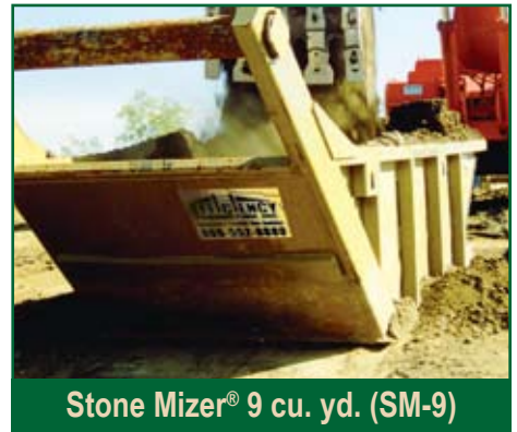
Stone Mizer® 9 cu. yd. (SM-9)