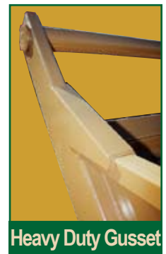
Heavy Duty Gusset