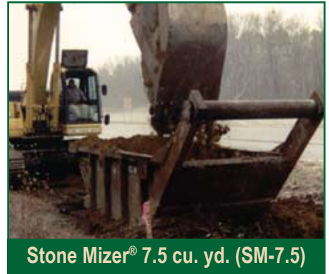
Stone Mizer® 7.5 cu. yd. (SM-7.5)