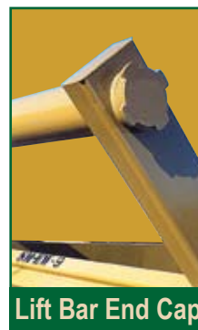
Lift Bar End Cap