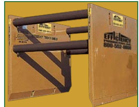
Without Corner Protection