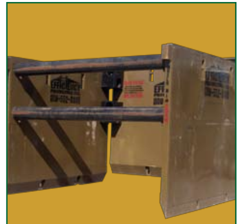
Three-Sided Manhole Shield