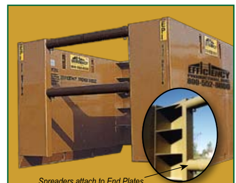
Spreaders attach to End Plates