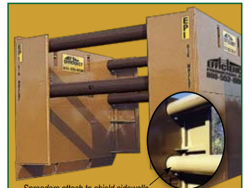
Spreaders attach to shield sidewalls