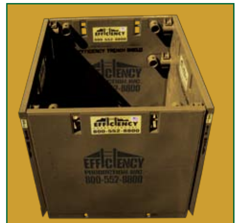
Four-Sided Manhole Shield