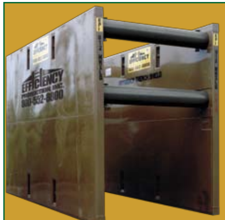
Two-Sided Manhole Shield (MHXLD)