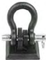
LIFTING DEVICE AND LOCK