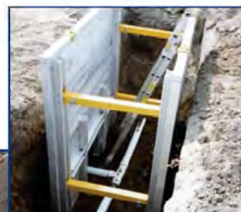
XLAP™ Aluminum Shield w/ cutout