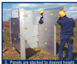
3. Panels are stacked to desired height.