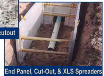
End Panel, Cut-Out, & XLS Spreaders