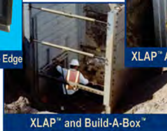
XLAP™ and Build-A-Box™