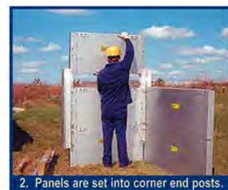
2. Panels are set into corner end posts.