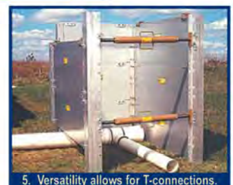
5. Versatility allows for T-connections.