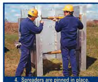
4. Spreaders are pinned in place.