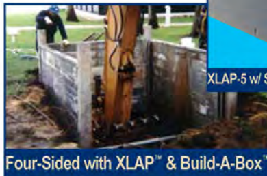
Four-Sided with XLAP™ & Build-A-Box™