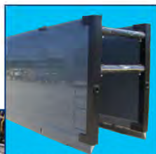
XLAP-5 w/ Steel End Frame, Knife Edge