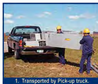
1. Transported by Pick-up truck.